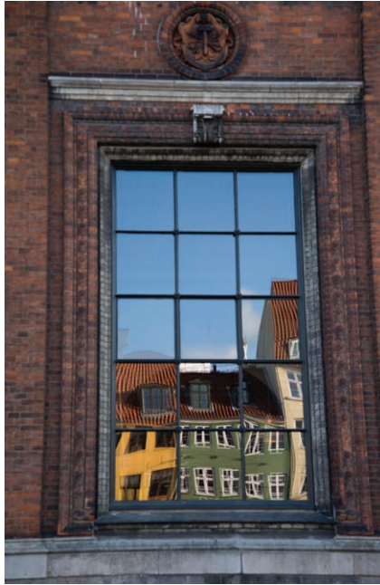
Houses in Nyhavn, Copenhagen