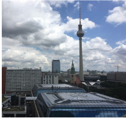
View from the Dom, Berlin