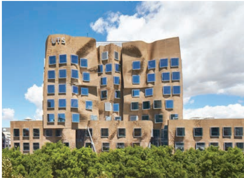
Dr Chau Chak Wing Building designed by Frank Gehry UTS, Sydney