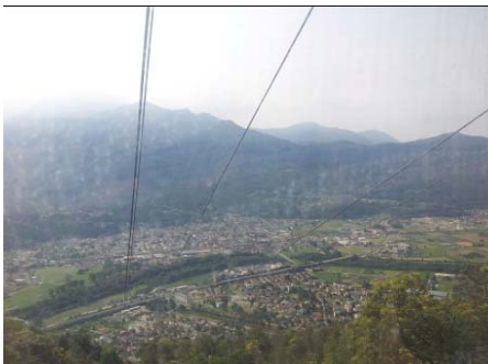
Reaching Mornera with the cablecar