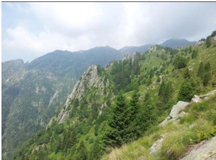
Hiking to the top