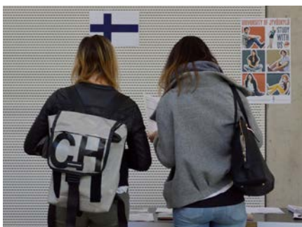
Two information sessions for students wishing to study abroad.

Registration for the presentation and the fair is not required.