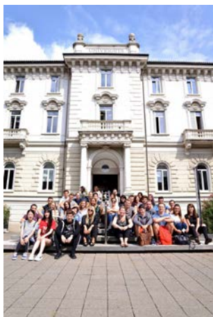
Group picture of the newly arrived students at USI main entrance.

This semester USI welcomed 36 newly arrived exchange students in Lugano Campus and 23 in Mendrisio Campus at the Academy of Architecture. They will be studying at USI during the Fall Semester or the whole academic year 2017/18: 43 of them come from our European partner universities in the frame of the SEMP programme, 11 of them are involved in the International exchange programme, 4 students come from Switzerland and 1 is a free-mover student. We wish all of them a pleasant and successful semester at USI!