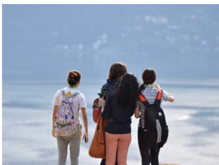
Lost or just admiring the landscape?

Via Nassa, connecting LAC to Piazza Riforma, in the city center, is not only a famous shopping street hosting many different shops, from jewellery and clothing to gastronomy, but also one of Lugano’s historical streets with ancient city porticoes.