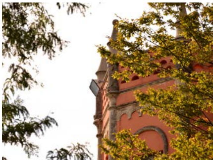
The pink Enderlin tower at the Parco Tassino.

The Funicolare degli Angioli, nowadays unknown to many visitors, started its activity in 1913 to link the shore of the Lugano lake to the Bristol Hotel, the first Grand Hotel in Ticino, opened in 1903, closed in 1981 and now a condominium. In 1973, the funicular was acquired by the City of Lugano, which decided to suspend the exploitation in 1987 to think of a new financial and technical solution. It seems that a project to replace it with an electrical stair already existed, but today, as then, the funicular is still there.