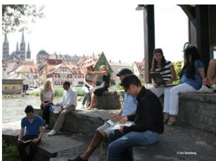
Library by the river Regnitz

The University also offers a Buddy Program, called TANDEM, which matches each international guest with one Bamberg student. The German students are available to assist the international participants with the first mandatory administrative steps in Bamberg and to ease the transition period. The German tandem partners also provide their international partners with a personal introduction to student life in Bamberg.”