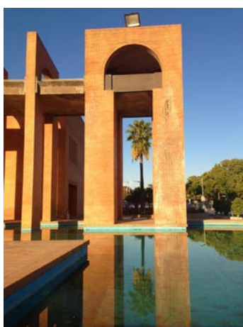
Seville Conference and Exhibition Centre

During one of these meetings arose the idea of creating a new section of the newsletter entitled “Discover an USI partner university”.