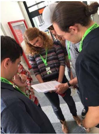
The treasure hunt starts at Lugano train station.

“Foxtail” organizes various treasure hunt trail experiences in popular Swiss destinations bringing participants to both famous sights and less known hidden areas of town; as was the case in Lugano.