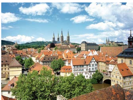
Aerial view of Bamberg city centre.