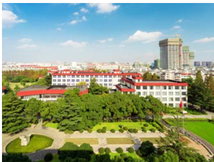
Shanghai University of Finance & Economics Campus.

“Come and go” is the International Relations and Study-abroad newsletter which aims at keeping our readers up-to-date on the latest news and events related to our activities. It is published 4 times per year and reaches approx. 4'000 readers, in particular USI students, faculty and staff, incoming students and staff from our many partner universities and other collaborators. We do hope you will enjoy reading it!