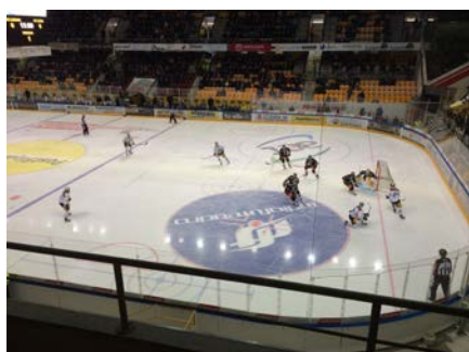
An intense moment of the match: HCL vs. EV Zug.

ed in the southern part of the canton, and HC Ambrì-Piotta, located in the north. The two teams have long been fierce rivals, with every derby pitting the respective fandoms against each other to make the match a most heated and enjoyable affair – in and out of the ice rink.