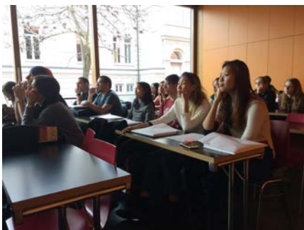
Welcome day for exchange students, Lugano Campus.

There are two Ticinese teams active at the national level: HC Lugano, locat-