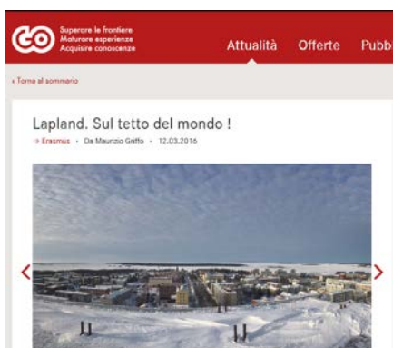
Maurizio Griffo's blog on the National Agency website.

The scholarships are offered for the following type of courses: Undergraduate University courses (renewals only); Postgraduate University courses; Master's Degree courses (Levels I or II); Ph.D. Courses; Specialisation Schools; Research under academic supervision; Courses of Higher Education in Art, Music and Dance (AFAM); Advanced Courses on Italian language and culture Courses for Teachers of Italian as second language. For more information: http://www.esteri.it/mae/resource/doc/2016/03/bando_a.a._2016-17_en.pdf