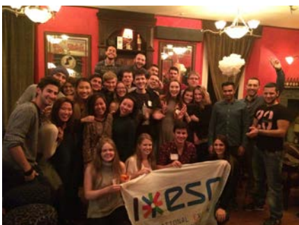
Aperitivo with ESN at the Trinity Irish Pub.