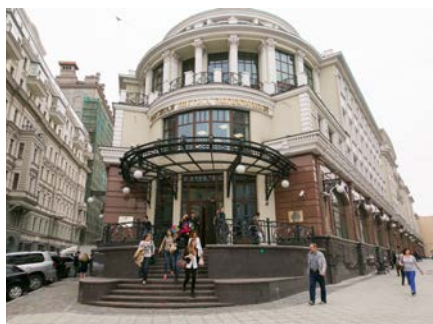
Higher School of Economics Campus.

Faculty, researchers, and students represent over 50 countries, and are dedicated to maintaining the highest academic standards. Now a dynamic university with four campuses, 2500 instructors and 27000 students HSE is a leader in combining Russian education traditions with the best international teaching and research practices. HSE offers outstanding educational programmes from secondary school to postgraduate studies, with top departments and research centres in a number of international fields.”