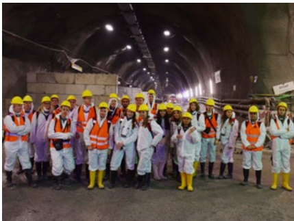
The group with helmets, boots and oxygen masks visiting the tunnel.

On a cold but sunny November Saturday morning, the International Relations and Study-Abroad Office organized its second day trip activity of the academic year. 22 international students currently studying in Lugano and Mendrisio had the chance to spend the day visiting AlpTransit and eat fondue surrounded by the Alps.