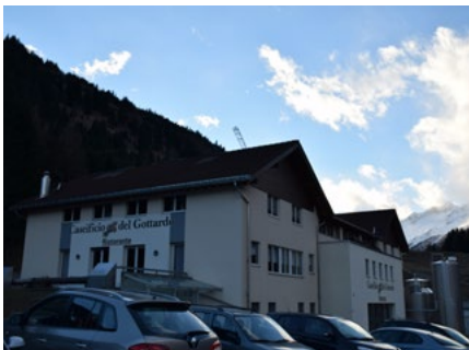
The Caseificio del Gottardo.

The daytrip started at pick-up spots in Mendrisio and Lugano fairly early for a Saturday morning (8.00am), when the students boarded one of the newest Autopostal busses with panoramic windows. The group, accompanied by Arianna and Francesco from the Office, travelled to Sigirino (a village on Mount Ceneri, the pass separating upper from lower Ticino) where the southern section of AlpTransit's excavations are taking place. After a detailed presentation about the ambitious railway tunnel project through the Alps, the groups headed below ground to explore the actual tunnels still under construction. Their impressions were of general amazement at the engineering feats performed by the workers, who excavate huge spaces underground where most of the construction processes (like concrete production) are started and finished. These huge caves, once the actual tunnel is completed, get filled with detritus and sealed off forever.