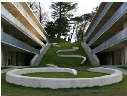
The Casa dell'Accademia in Mendrisio.