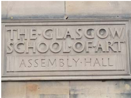
Assembly Hall sign, Glasgow School of Art.