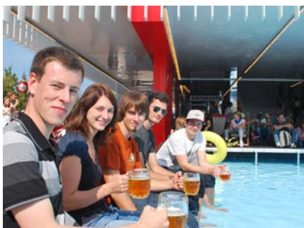
Enjoying a pint at the Slovenian Pavilion.

Expo2015 for free. After an early morning bus ride from Lugano, with a pick-up stop at the campus in Mendrisio, to Milan, USI's delegation of roughly 160 people between students, alumni, professors, and staff was met with massive crowds at Expo's entrance. It was to be a record breaking day for the exhibition, whose attendance almost broke through the 260,000 people mark, probably spurred by the marvellous weather in Milan that weekend.