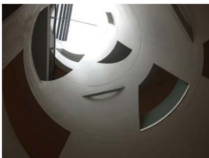
Reid Building, Glasgow School of Art.