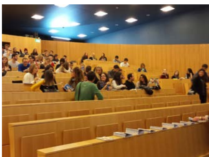
During the Information Session, exchange programmes, partner universities, application procedures,... will be presented.

The International Relations and Study-abroad office is pleased to announce that two information sessions for USI students interested in studying abroad during the academic year 2016-2017 will take place in Lugano on: