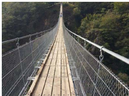
The Tibetan bridge in the valley of Sementina.

If you suffer from vertigo, this is definitely not the right place to be. In fact, today we would like to suggest you a unique experience: the thrill of crossing one of the longest Tibetan bridges in Switzerland (270 m)! The footbridge is in the valley of Sementina, located on the outskirts of Bellinzona. It was officially opened in spring this year and it acts as a connection between the communities of Sementina and Monte Carasso. Anchored at a height of 696 m, with a point center that rises 130 m above the river below, it is the right place to admire the beautiful panorama, including the Magadino Plain, the mountains and, in the distance, the Castles of Bellinzona.