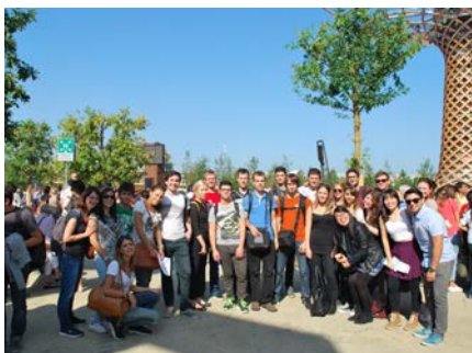
The group of exchange students at the Tree of Life, Expo Milan.