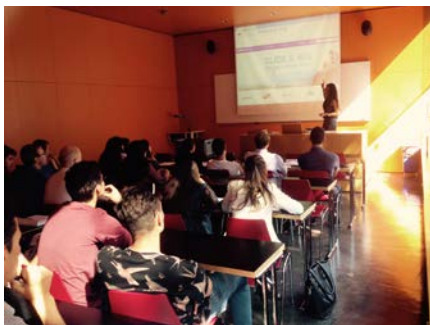
Welcome day for exchange students, Lugano Campus.

On Saturday 26 September, USI was hosted at Expo Milan, and exchange students were offered the chance to attend the special day-long event USI@